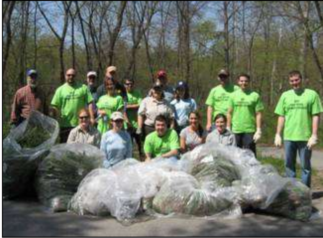
Community Betterment Projects