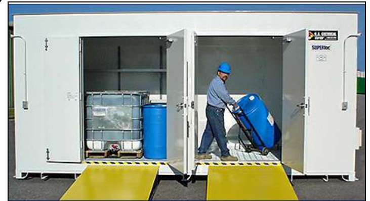
Regional HHW Collection Center