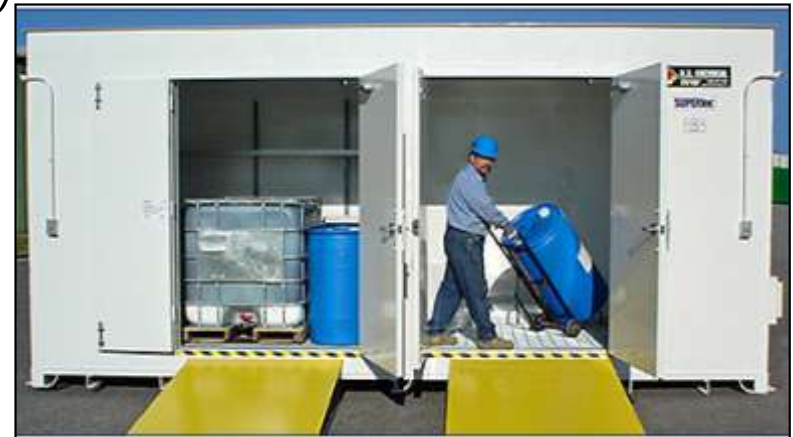
Regional HHW Collection Center