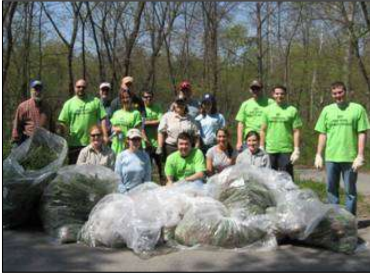
Community Betterment Projects