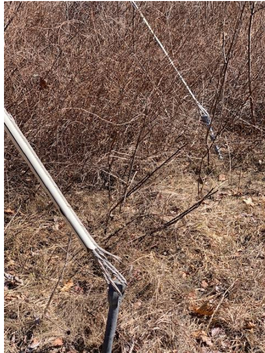
Support cables in upland area – March 23, 2021