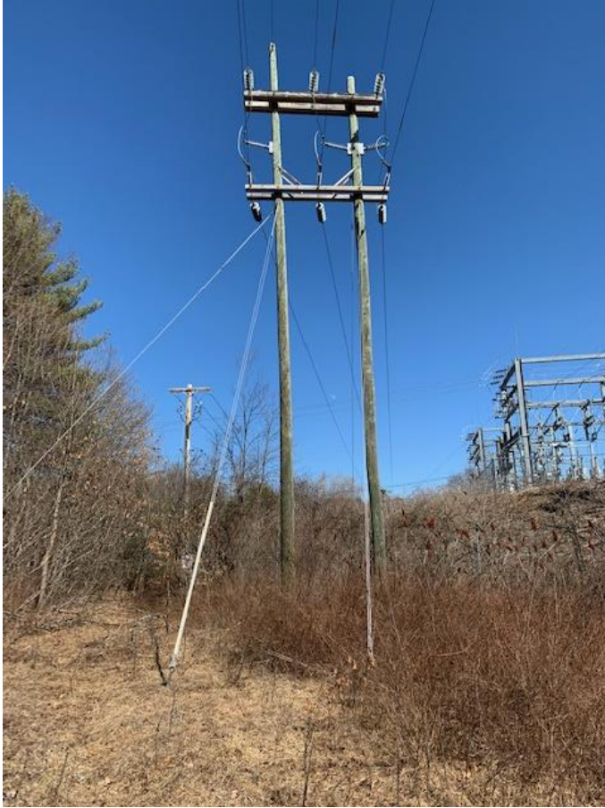
Consolidated Poles – March 23, 2021