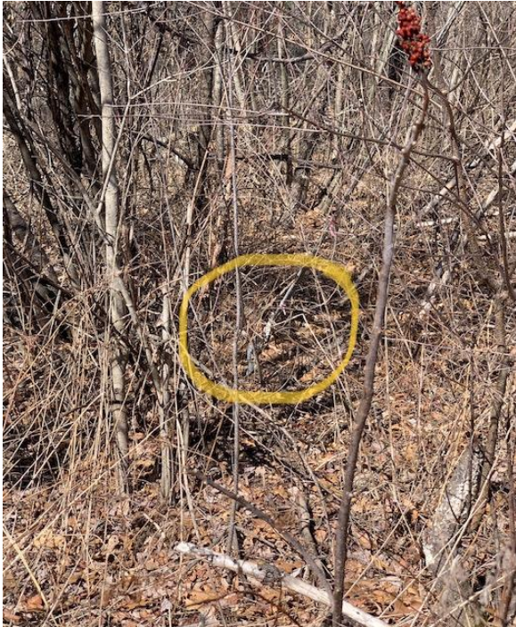
Support cable in Wetland – March 23, 2021