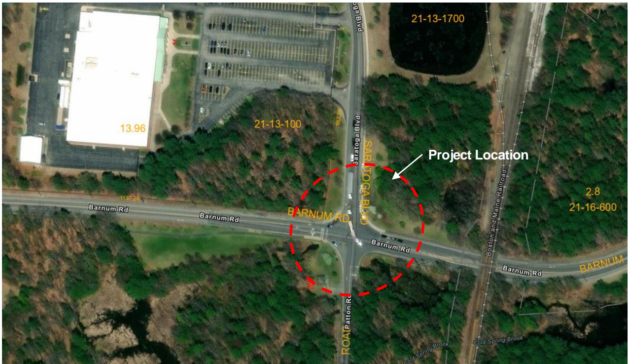
The proposed project includes signal upgrade work at the intersection of Patton and Barnum Roads.