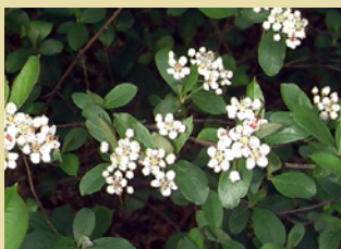
Chokeberry ( Aronia melanocarpa )