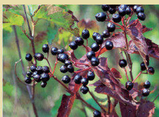
Northern arrowwood ( Viburnum dentatum )