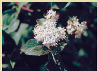
Dogwoods ( Cornus sericea , C. amomum , and C. racemosa )