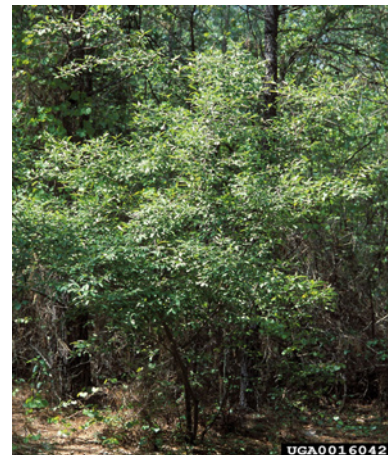
An autumn olive plant.

bark on the lower portion of the woody plant is also an effective control. Multiple treatments may be required. Always read and follow pesticide label directions.